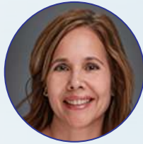
Kim McLeod-Estes Duke Health Center, USA